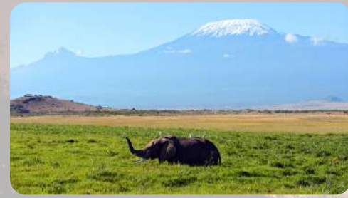
DAY 3: AMBOSELI