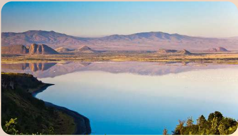
DAY 4: LAKE ELEMENTAITA