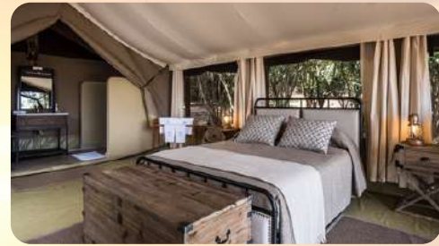
DAY 6: MASAI MARA