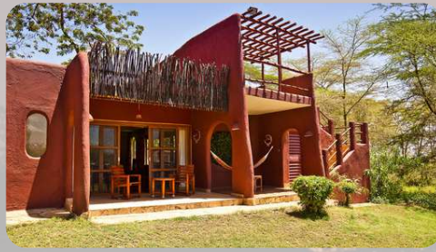
DAY 2: AMBOSELI