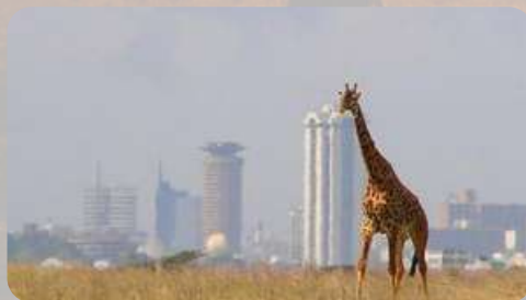
DAY 8: NAIROBI