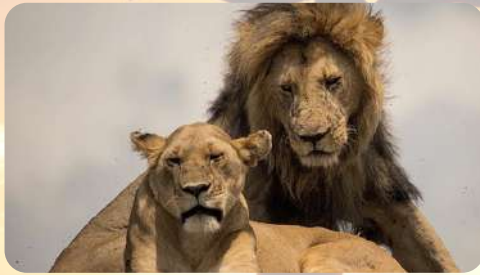
DAY 5: MASAI MARA