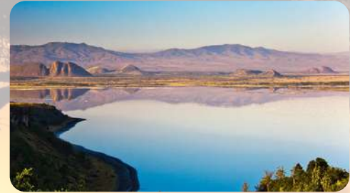
DAY 6: ELEMENTAITA