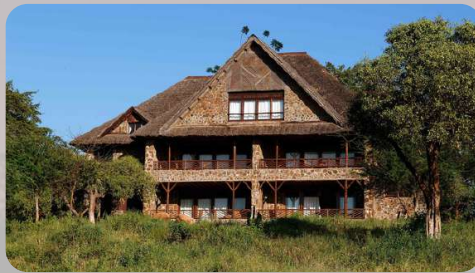
DAY 2: TSAVO