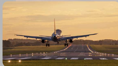
DAY 11: HOMEBOUND