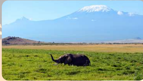
DAY 5: AMBOSELI