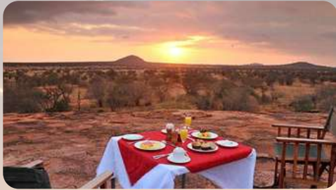
DAY 4: AMBOSELI