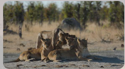
DAY 3: TSAVO