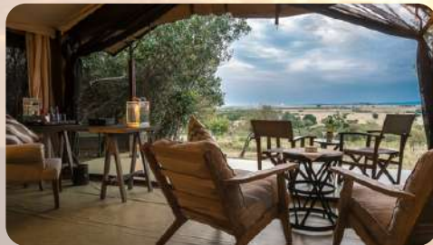
DAY 7: MASAI MARA