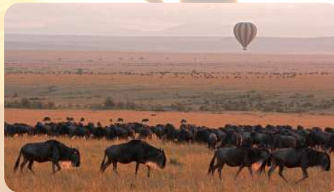
DAY 8: MASAI MARA