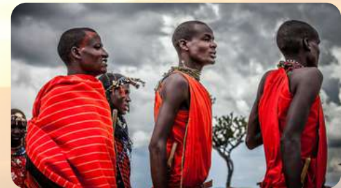
DAY 9: MASAI MARA