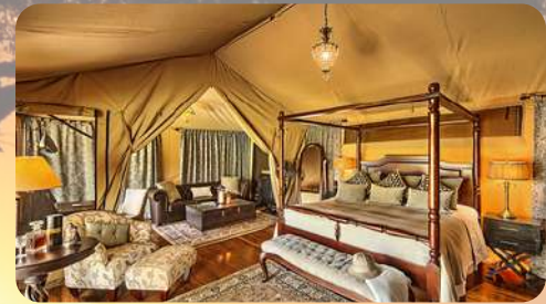
DAY 6: MASAI MARA