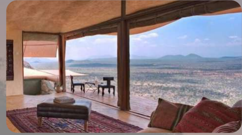
DAY 3: SAMBURU