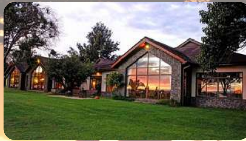
DAY 5: OL PEJETA