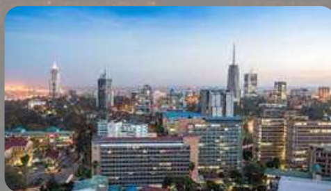
DAY 10: HOMEBOUND