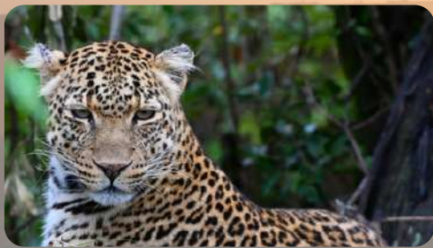
DAY 7: MASAI MARA