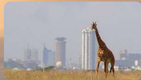
DAY 9: NAIROBI