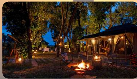
DAY 8: MASAI MARA