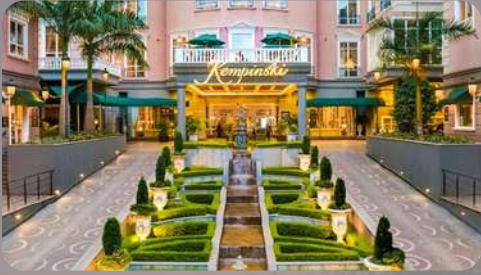
DAY 1: NAIROBI

A short snapshot of your trip taking you through 4 spectacular regions of Kenya