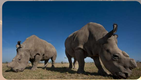
DAY 4: OL PEJETA