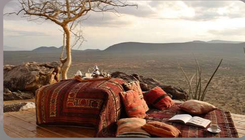
DAY 2: SAMBURU