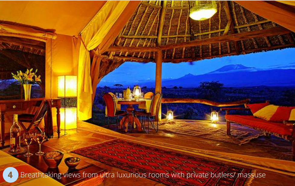
4 Breathtaking views from ultra luxurious rooms with private butlers/ massage