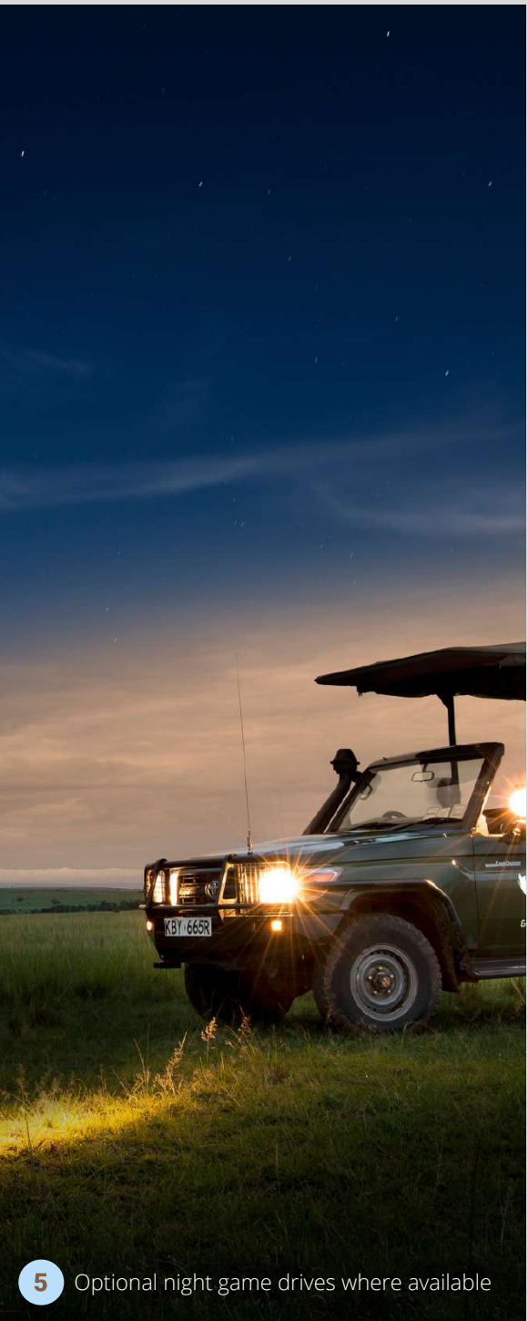
5 Optional night game drives where available

A DAY WITH US Join Us as we take you through one day on safari with Cosmic Safaris