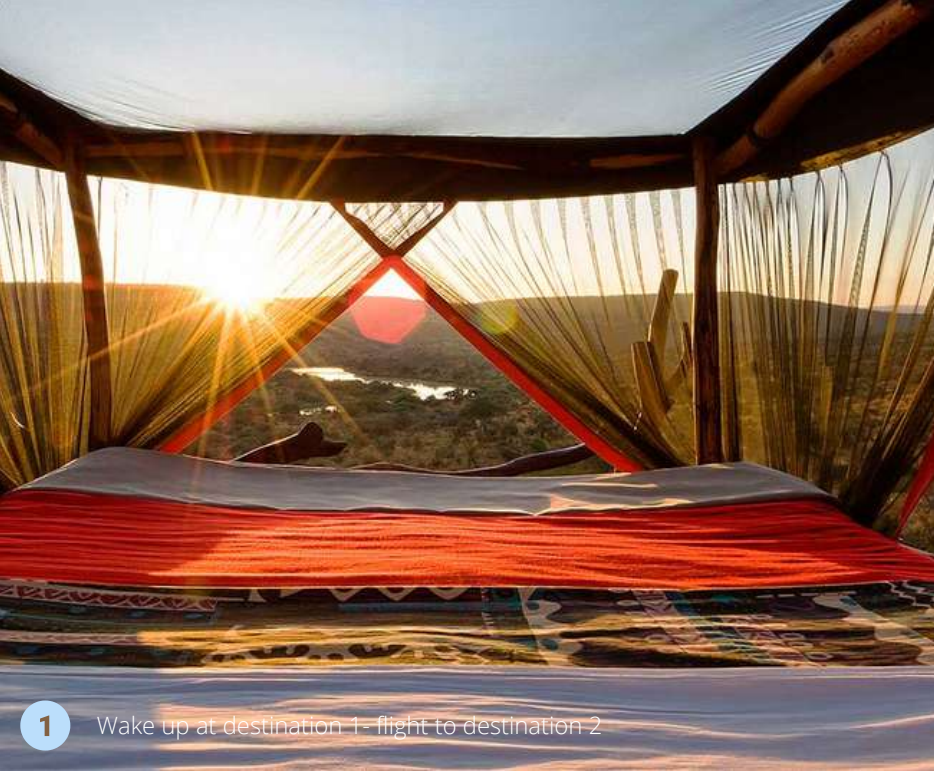
1 Wake up at destination 1- flight to destination 2