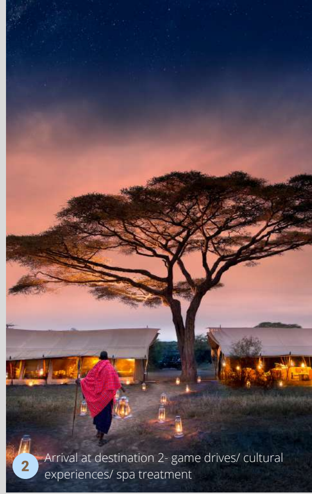
2 Arrival at destination 2- game drives/ cultural experiences/ spa treatment