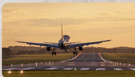
DAY 6: HOMEBOUND