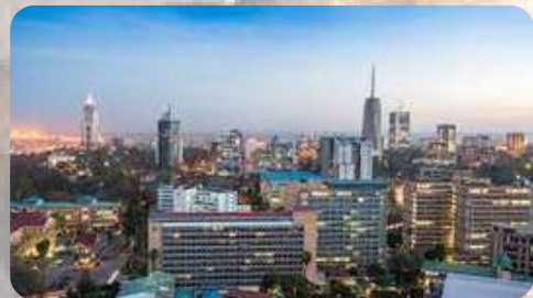
DAY 6: NAIROBI