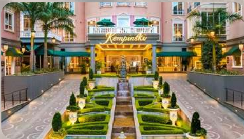
DAY 1: OL PAJETA

A short snapshot of your trip taking you through 3 spectacular regions in Kenya. Specially curated