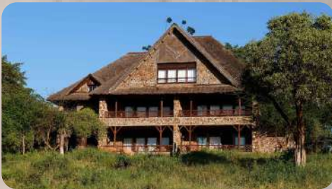
DAY 3: NAIVASHA