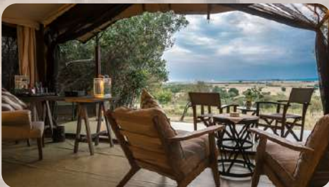
DAY 5: MASAI MARA