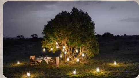
DAY 2: OL PAJETA